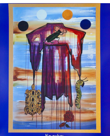
November Celebrating American Indian Heritage Month

November has been designated as Native American Heritage Month, and the time to celebrate the culture, accomplishments, and contributions of people who were the first inhabitants of the United States, and on whose land we live today.